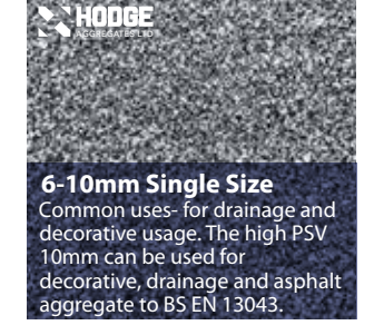
High (68/71) PSV aggregates available at Duneaton Quarry, Abington, loose or bagged.